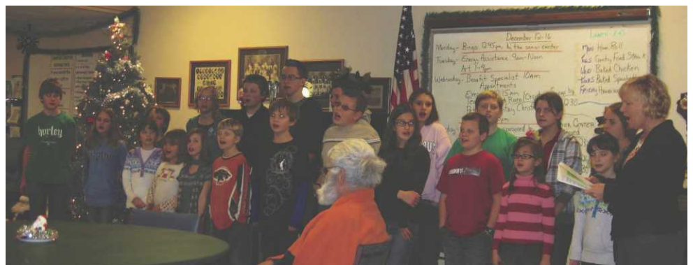
Petersen Elementary students, first through 8th grade, performed a Christmas program at the senior center on December 14.